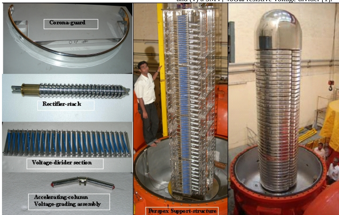
Figure 1: (Left) multiplier sub-systems, (middle) acrylic-support with divider and (right) assembled multiplier.

Main sub-systems of the voltage multiplier include (i) a UHV terminal of 98cmOD x80cm height, (ii) the 80 Nos. of 97cmODx7cm(H) semi-circular corona-guards, (iii) an acrylic support-structure of 3.3m height and 64cmx64cm base, (iv) the 74 Nos. of rectifier-stacks of 176kV PIV and (v) a 3MV, 46GΩ resistive voltage divider [1].